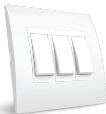
White - WH