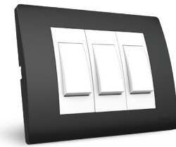
Black - BL