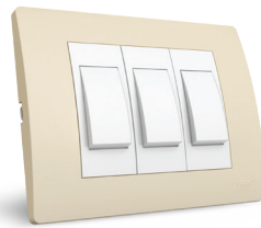
Ivory Gold - IG