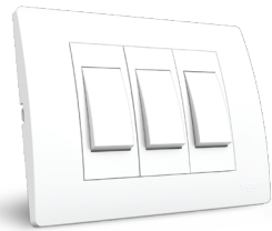
White - WH

Pristine white and high polish finishes of A1 Series seamlessly synergizes with traditional as well as contemporary interiors.