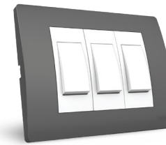
Gun Grey - GG