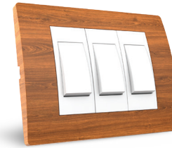
Rose Wood - RW