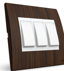
Wonder Wood - WW