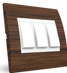
Smoked Teak - ST