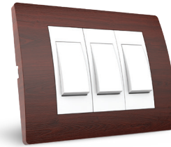
Walnut - WN