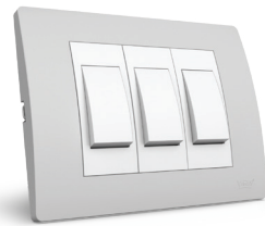
Light Grey - LG