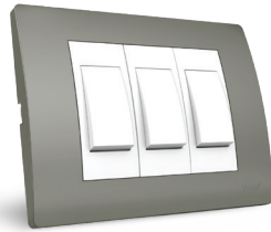
Hazel Brown - HR