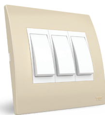
Ivory Gold - IG