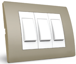
Twilight Silver - TS