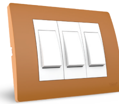
Hash Brown - HB