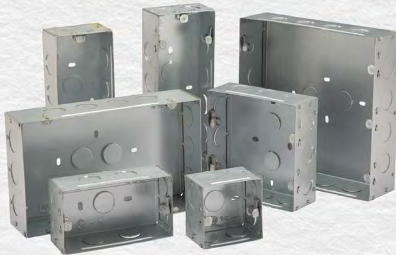
GPSP Material Metal Boxes