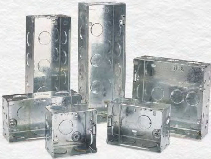
GI Metal Boxes